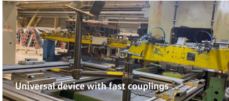
Universal device with fast couplings